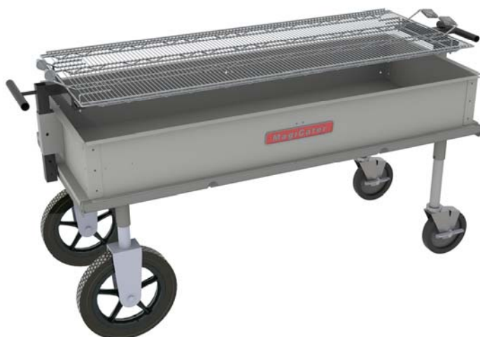
Shown with Optional EZ Roll Wheel